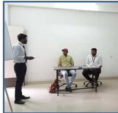
Figure 1: Expert's Introduction and Felicitation